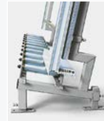
RVS/W RVT door frame