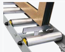
RV.ES 50/26 End stop