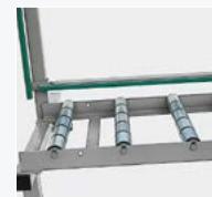
RV 27.5 Option 5-fold divided