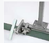
Drive unit with brake FH 10.2